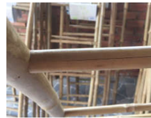
small natural crack mark on bamboo (not over 25cm)