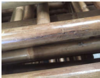
small natural defect on bamboo