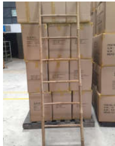
accepted curved level